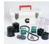
Cummins Onan Cruise Kit

Cummins®, Onan®, the "C" logo, Performance you rely on.™ and Quiet Diesel™ are servicemarks, trademarks and/or registered trademarks of Cummins Inc. / Specifications subject to change without notice / ©2007 Cummins Power Generation. All Rights Reserved. A-1475d (2/08)